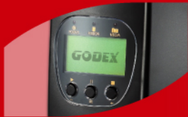
Upgrade Graphic LCD