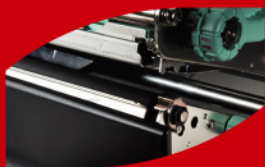
Adjustable sensor kit